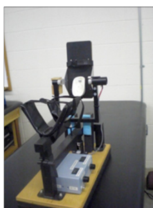
Figure 1: Electric ankle goniometer