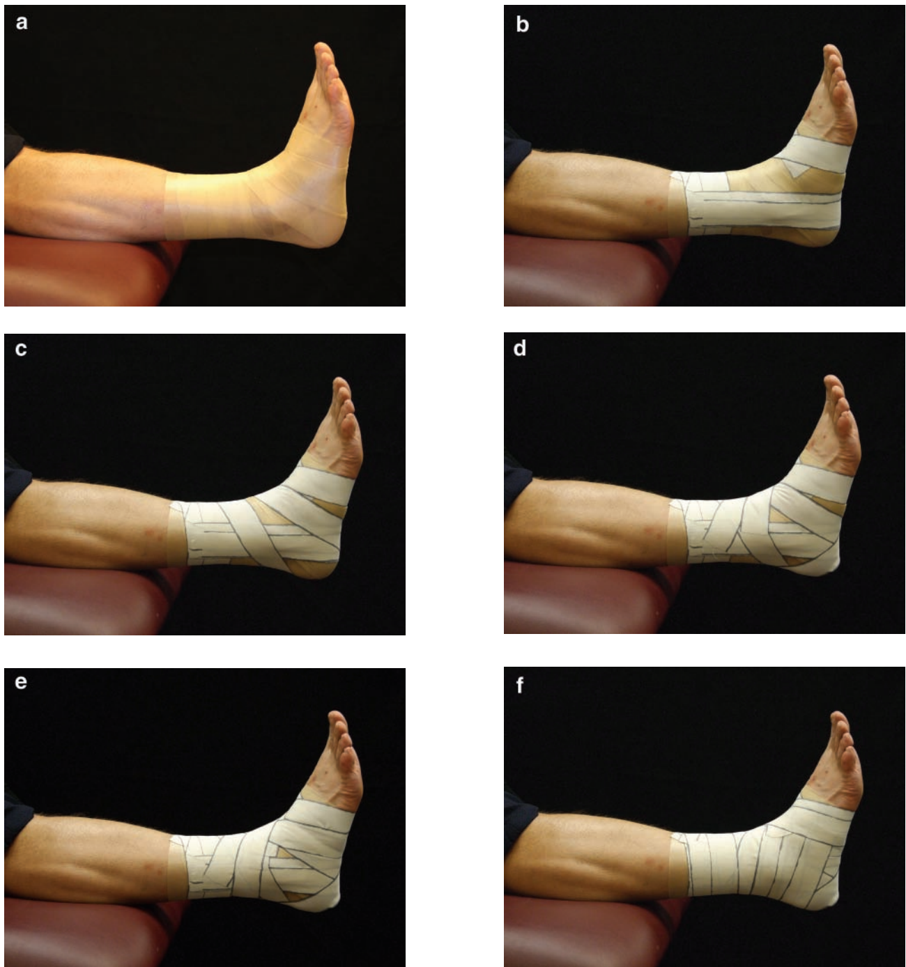
Figure 1. White cloth tape condition: a, prewrap; b, 3 stirrups; c, medial heel lock; d, lateral heel lock; e, figure-of-8; and f, completed.

dorsiflexion–plantar flexion range of motion on 2 separate days. The intraclass correlation coefficient (ICC) formula (2,k) was used to evaluate the data. For inversion–eversion range, the ICC was 0.87 (standard error of the mean [SEM] = 2.51°) and for dorsiflexion–plantar flexion range the ICC was 0.99 (SEM = 1.41°)