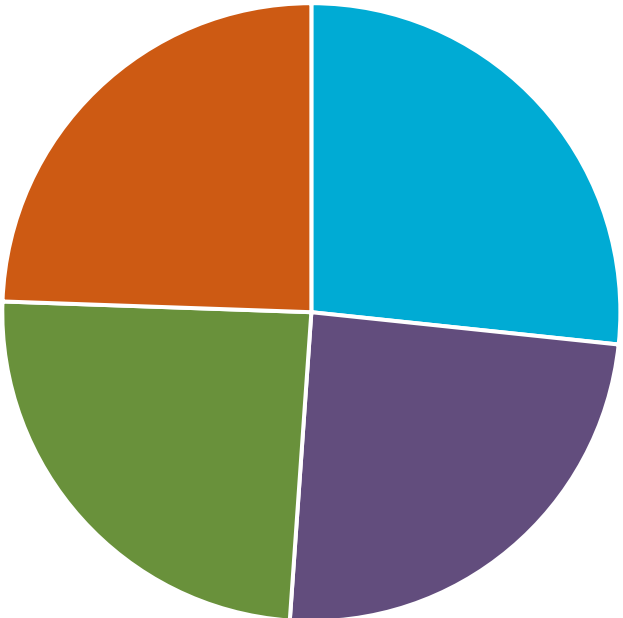
2024 GIVING BY PILLAR

■ A HEALTHY TOMORROW ■ INSPIRED SOLUTIONS ■ LEADING WITH PURPOSE ■ TOGETHER WE STRIVE